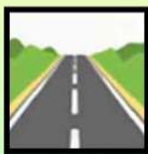
40 ft - CC Roads