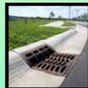
Storm Water Drains